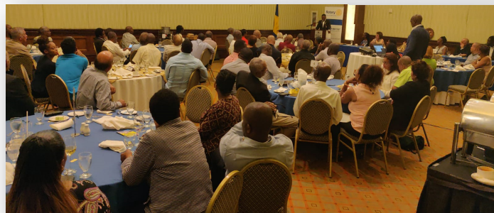
Cross section of the audience paying close attention