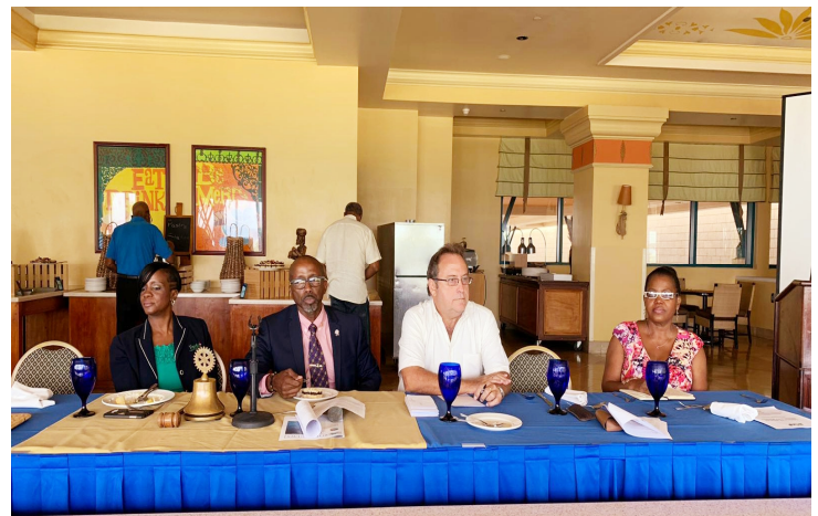
Above: Part of the head table