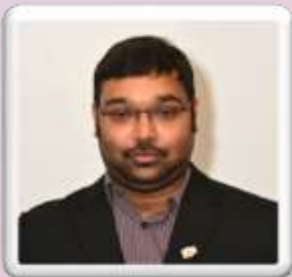
Ravi Ramanand Pharmacy