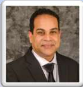
Rudranath Maraj Laboratory Services