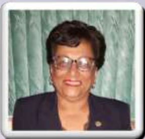
Zobida Ragbirsingh Counselling Services