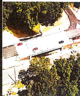
Lancaster Pike and Bridge I-198 Road and Bridge Construction Delaware Department of Transportation