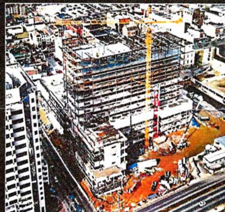
New Castle County Courthouse Structural Concrete and Sitework Delaware Department of Administrative Services

Member of the Delaware Contractors Association