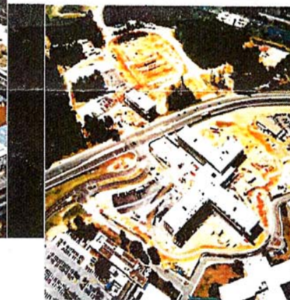
AstraZeneca US Business Center Structural Concrete for Buildings 40, 41, 51 & 52 Structural Concrete for Parking Garage & Pedestrian Bridge Vehicular Bridge Construction