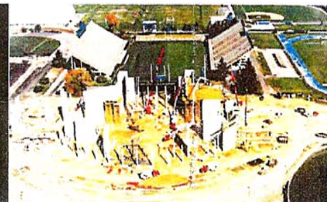
Bob Carpenter Center Structural Concrete University of DE

1005 Industrial Drive • Middletown, Delaware 19709 • (302) 378-7736