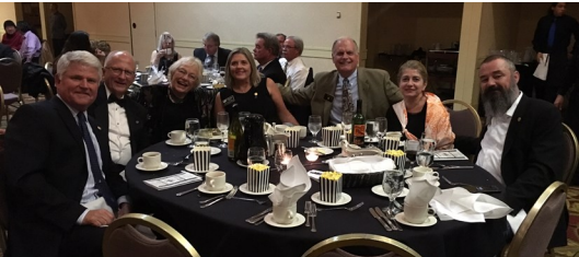
Rotary Foundation Dinner, Saturday, October 22nd