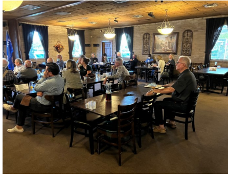
Membership in Attendance