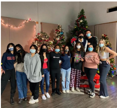
Left: RCHS Interact Members decorated the Teen Center