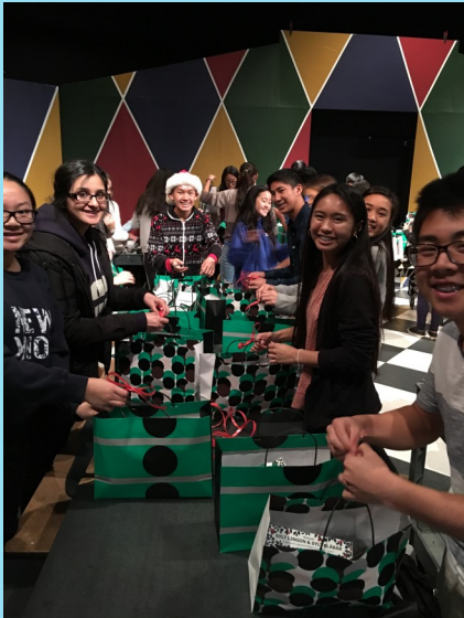
River City High School Interact students assembling Senior Gifts