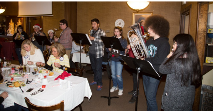
RCHS Band students play Christmas carols for the Club

RCHS Interact students opened the meeting by singing carols