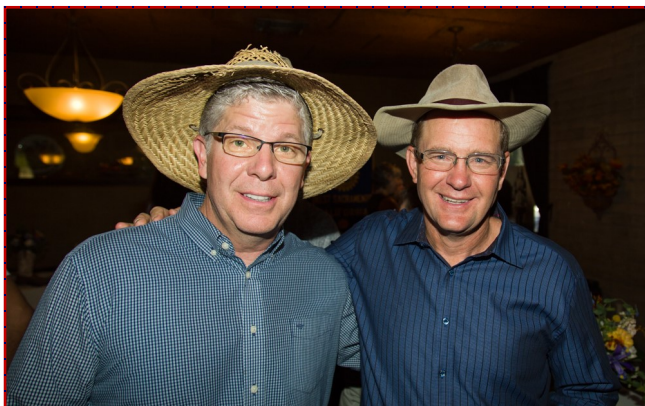
Left: The Wayward Twins prepare for their "light roast."