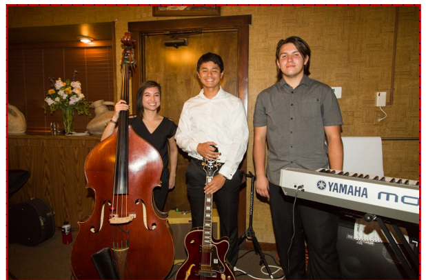
Right: The RCHS Jazz Band provides entertainment during dinner.