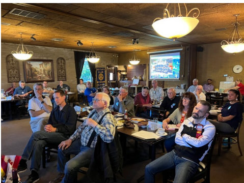
Membership in attendance