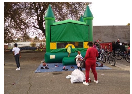
A bounce house was provided for the event