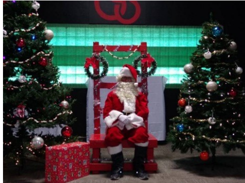
Santa Claus made an appearance