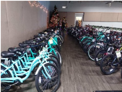
Bikes and toys ready to be picked up by kids