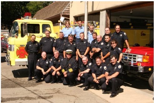
Clarksburg Fire Department