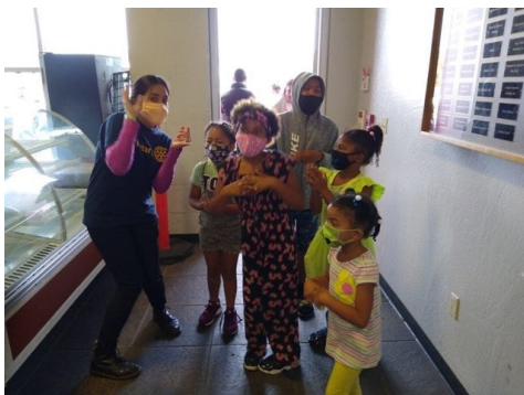
Kat greeting a family at the entrance