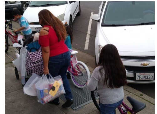
A family leaving with their toys and groceries