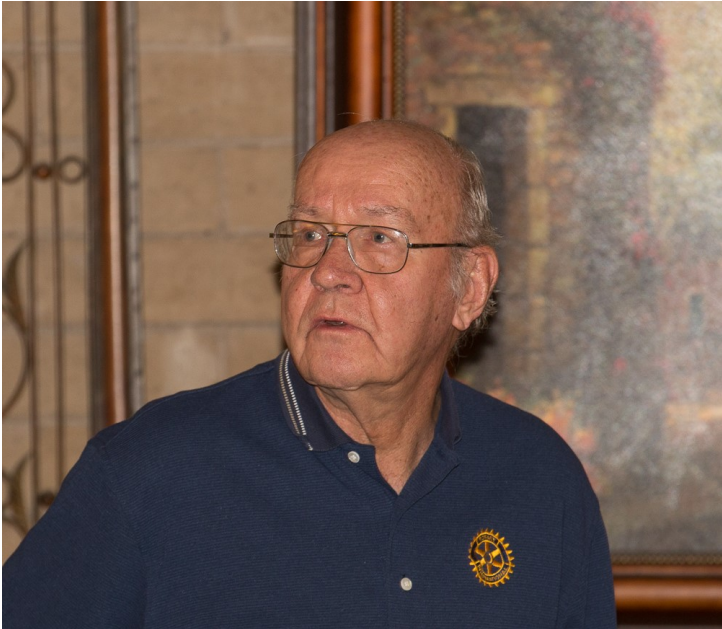
Visiting Rotarian from South Lake Tahoe

Please RSVP with your entre selection to Luan Christ bobandluan@comcast.net 916-502-2861, text or message