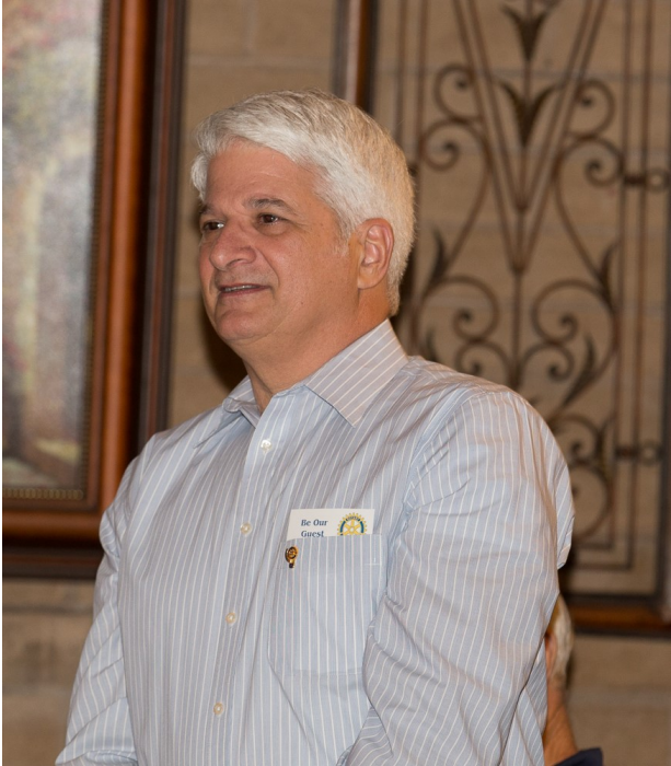
Visiting Rotarian from Orlando