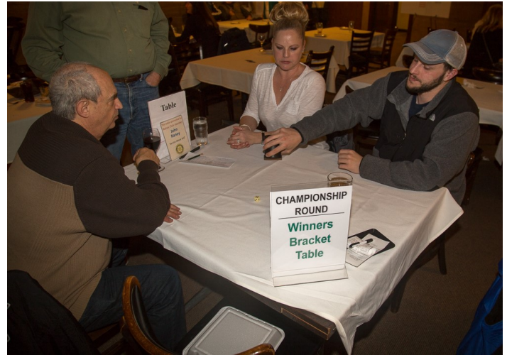
The Championship Table in action