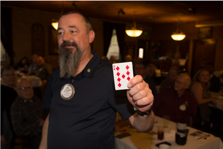
Heine drew the 9 of Diamonds