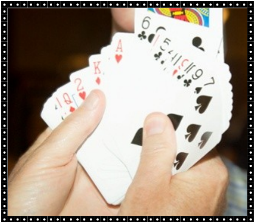
The Joker is still missing from this deck.