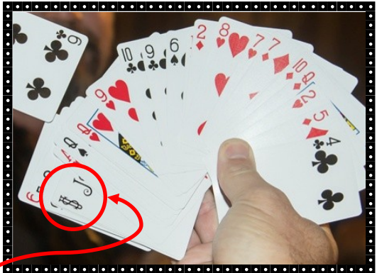
The joker has finally made an appearance!