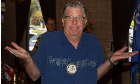
“What did I do?!?”