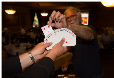
The 5 of Diamonds