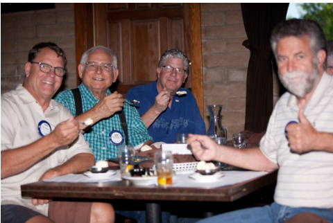
The ice cream table