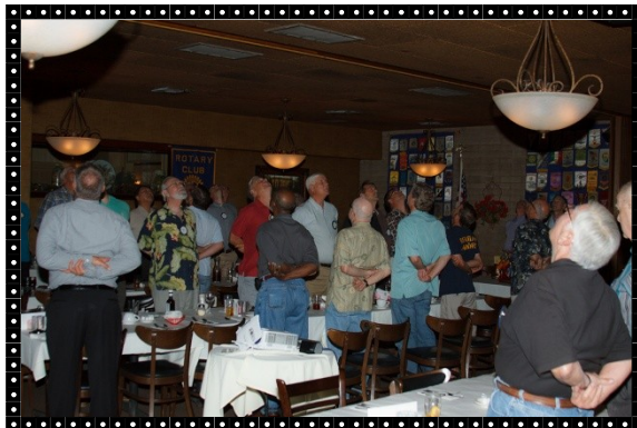
Club members get a chance to practice a little yoga and learn to stretch the limits of their arms.