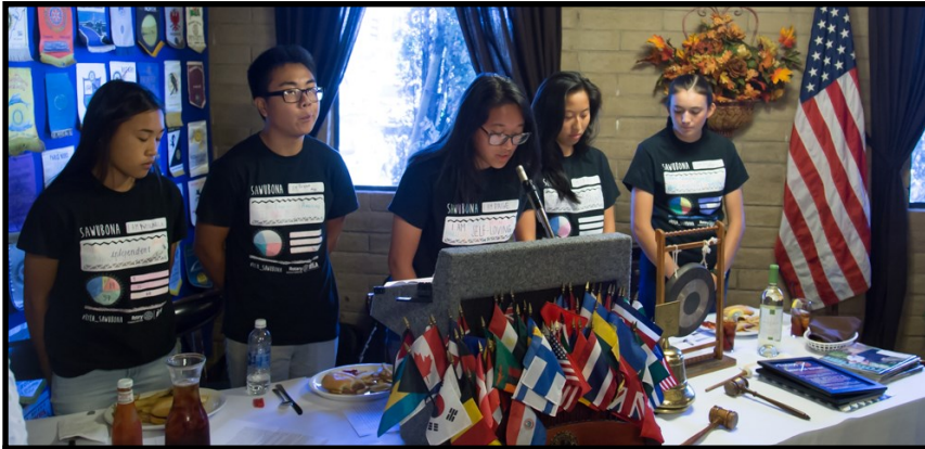
(left) RYLA students leading the meeting.