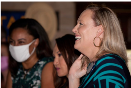
All laughs at the cool kids table