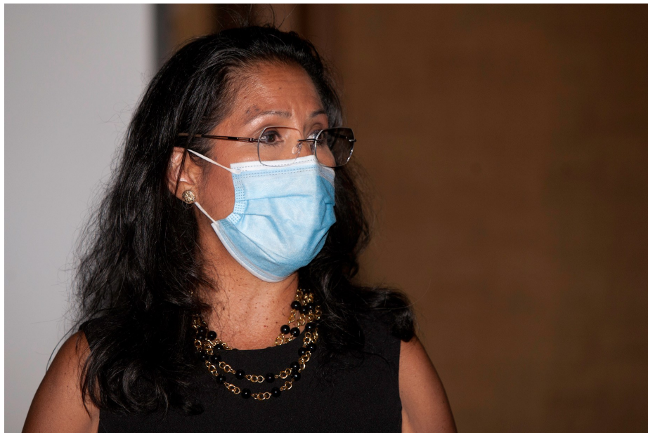
Mayor Martha Guerrero City of West Sacramento