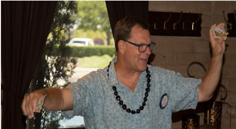
Selling cards from Hawaiian Deck