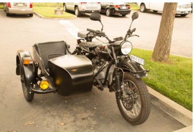
Someone comes to the meetings in style