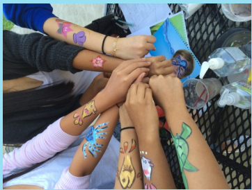
RCHS Interact Club face painting practice