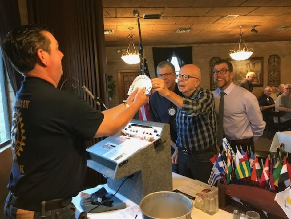
Mighty Is As Mighty Does