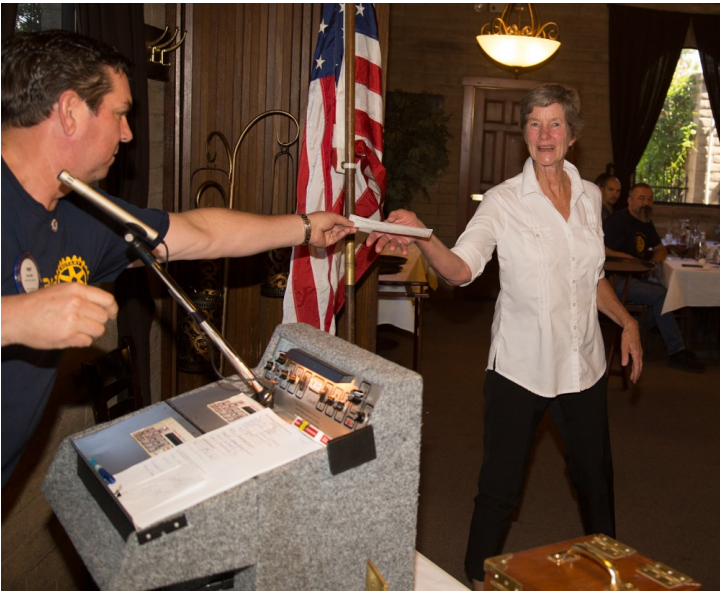
The club makes a donation to Journeys Within Our Community