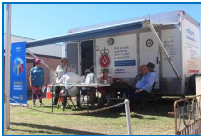
Men's Health Education Van