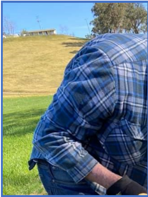
Ray Coulton getting rid of the old burnt fencing.