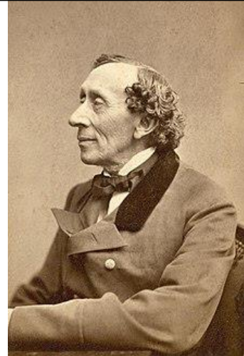
Andersen in 1869

The tulips have been optimistically planted in Corbett Gardens, but it is recognised that staging Tulip Times in any form is doubtful