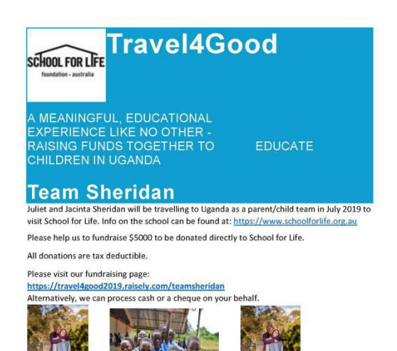
Thank you for your Support!