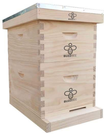
Traditional Langstroth hive