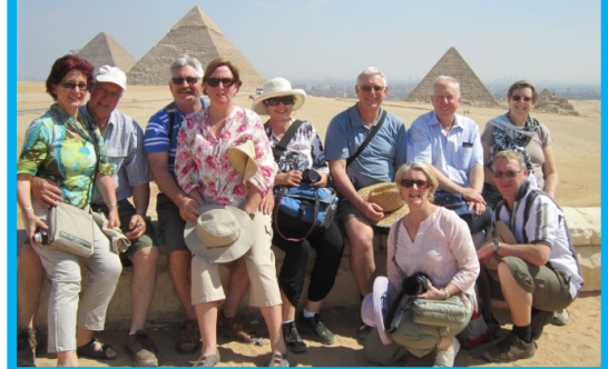
Our club members visit Giza in 2010

its opening with their District Governor. It was a welcome addition for the families of Mazoura and is becoming the centre of revival of shopping and commerce in the town.