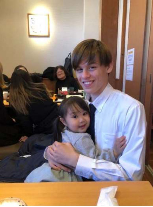
Figure 1 Asher's new friend