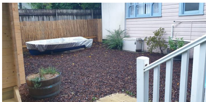
The boat and the planters finishing off the final touches needed in the playground

See you all at Next week's Venue – Southern Highlands Winery- Partners Night