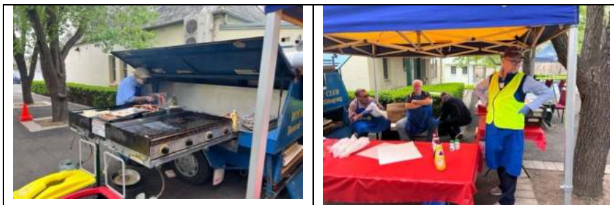
Interesting Photos – one working and others 'resting' !