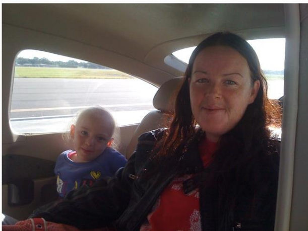
Angel Flight Narrabri passenger