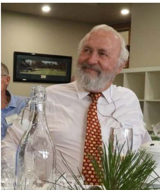
Figure 8 Santa Claus look alike