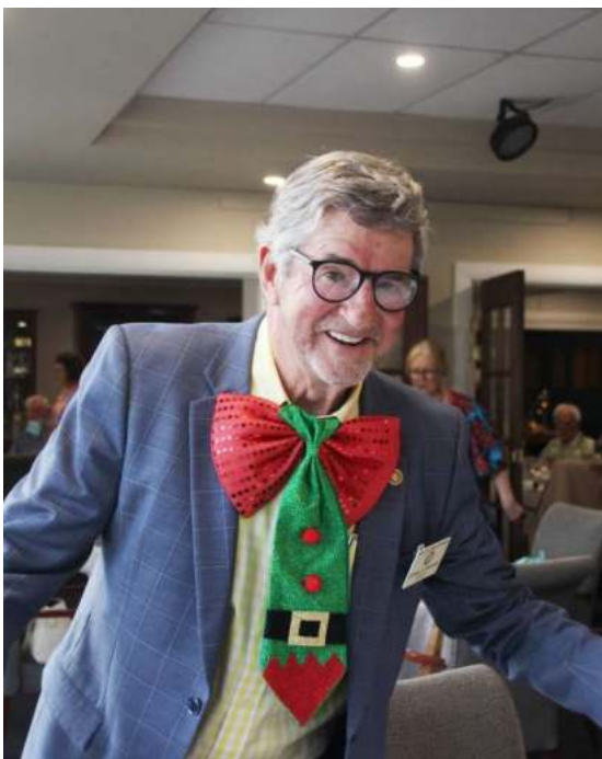
Figure 7 Winner of the Festive Tie Award