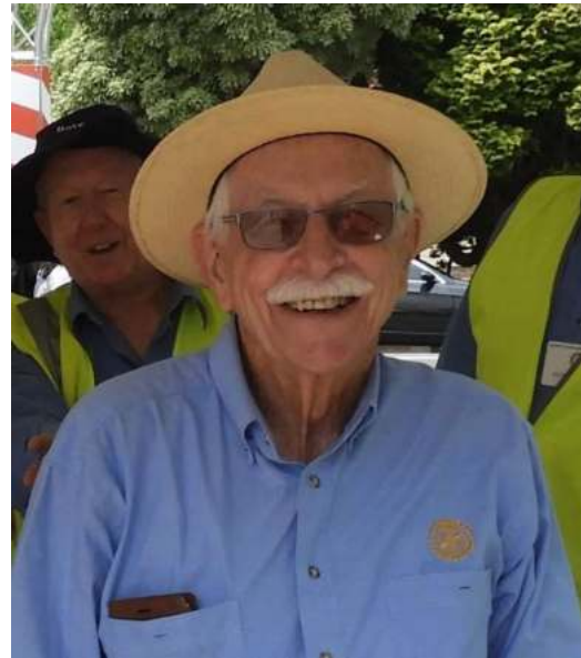
Figure 4 Thats better

The Week that was before the week that was