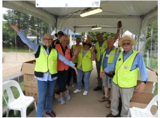
Figure 3 I said look happy and smile.