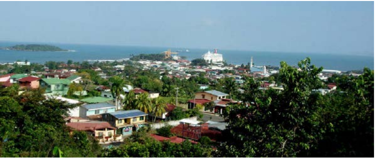
Limon, Costa Rica

All of the Clubs in District 4240 are campaigning this month to bring more young people into Rotary and the Rotary Club of Limón is has already inducted several new younger Members this Rotary year.