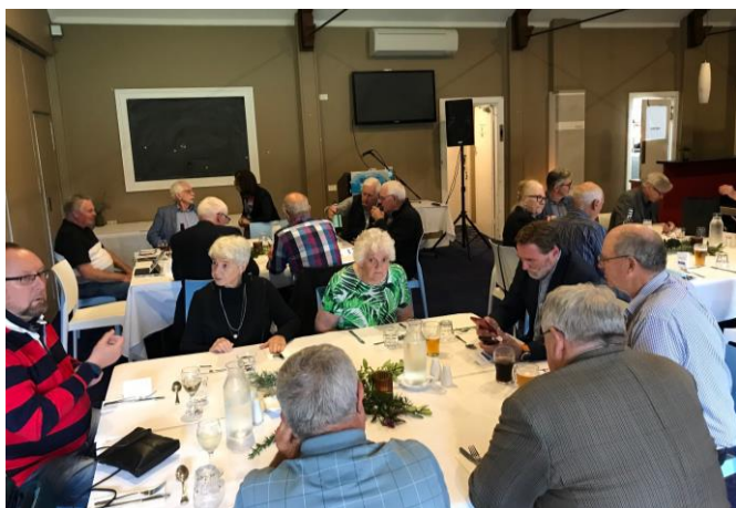
Photo of dinner at Bowral Bowling club