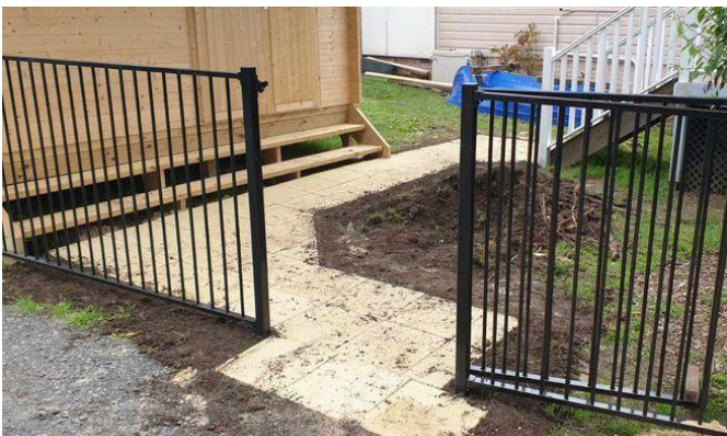
AFTER the paver fairies came