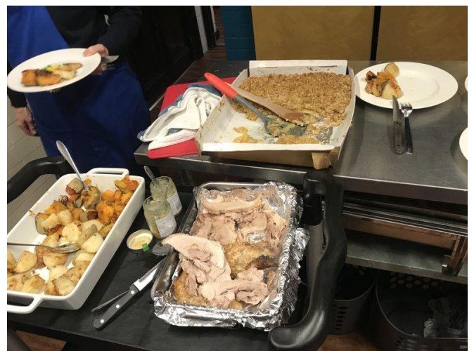
Pork by RSL & Crumble by Samuel Gee