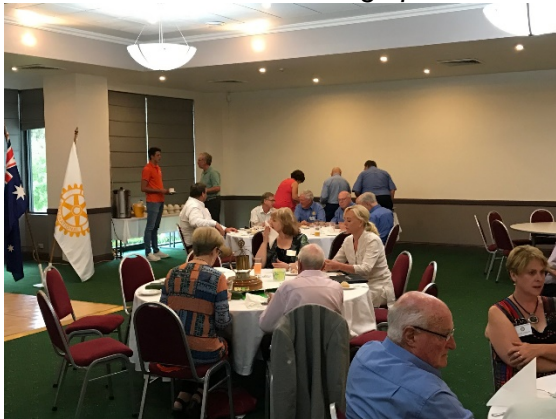
Members catching up!

Meeting was closed on time and a pleasant evening was had by all.