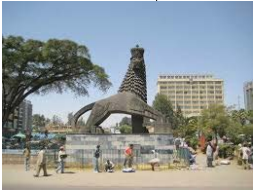
Addis Ababa Square