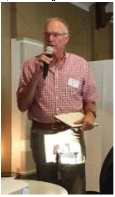
Where am I? Corowa