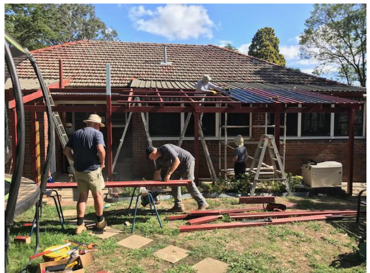
Youth Refuge construction finally under way!