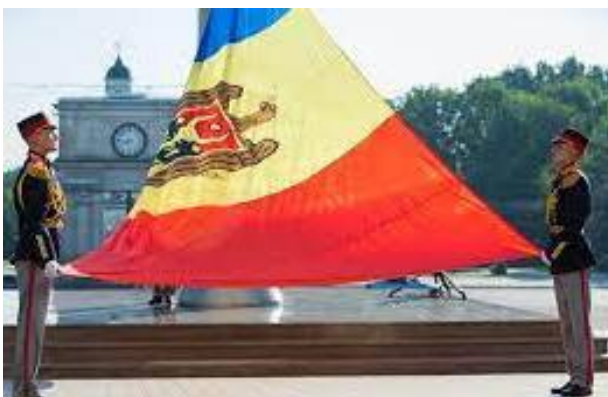
Moldova remembers victims of Stalin's deportation

It suffered forced deportations of native Moldovans under Stalin and since independence it has, like Ukraine and Georgia been subject to part of its territory declaring independence and support for Russia.