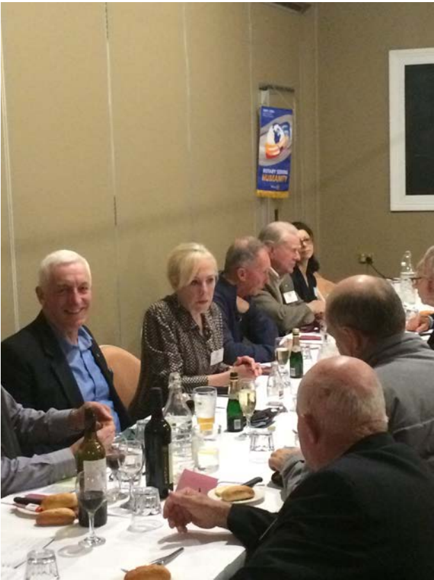
Members enjoying the fellowship!