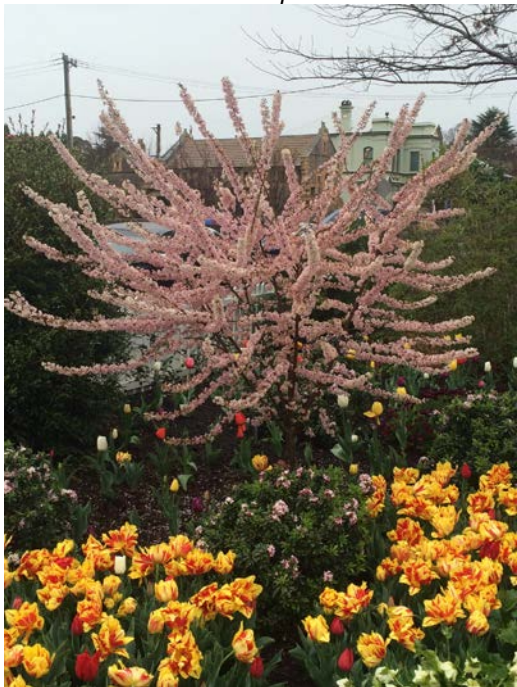
The tree in question!

David McCosh – group pays and enters the garden, a few minutes later came back and asks for a refund because it is too cold.