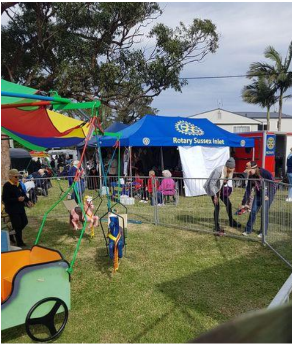
Viking Festival attended by the local Rotary Club at Sussex Inlet.