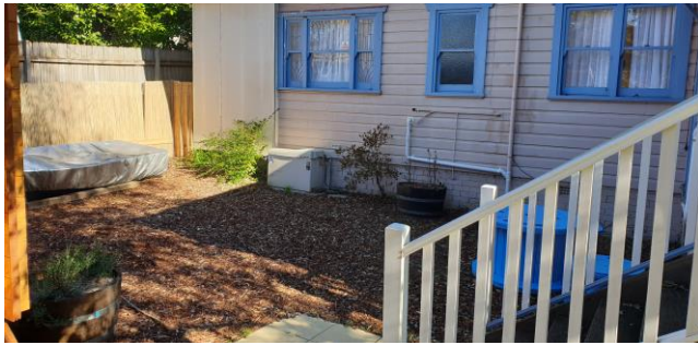
Bright blue play reels behind step railings

Provided electrical cable reels for play area;