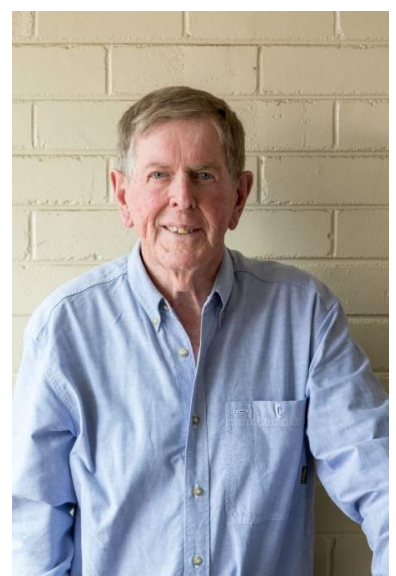
Born 3 July 1940 - Kings Cross

Culture - Sport and gambling and in more recently corruption.