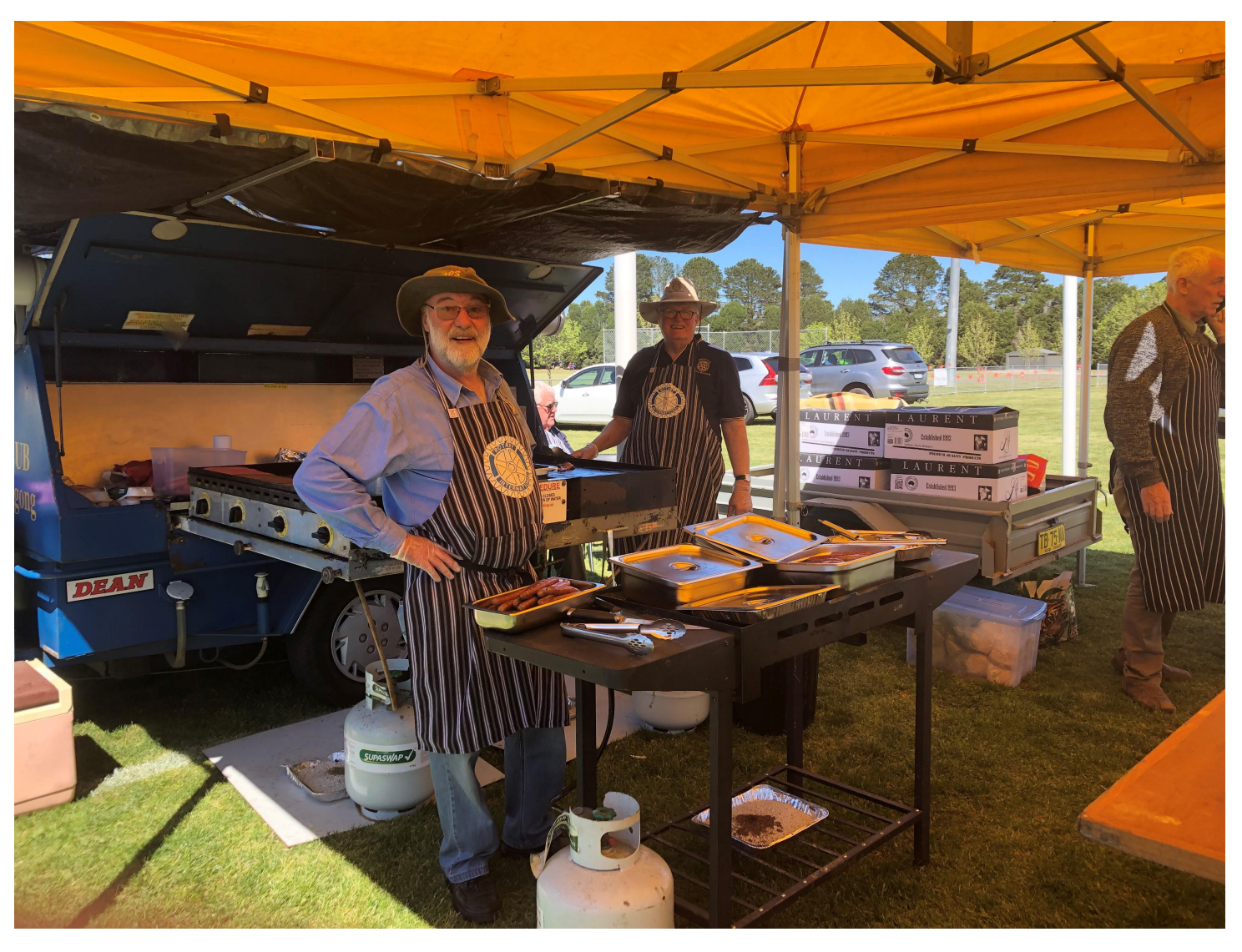
Title "Two Workers!"