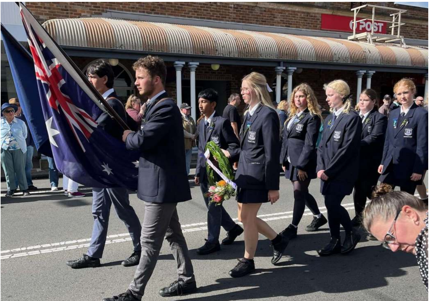
Bong Bong Street Bowral