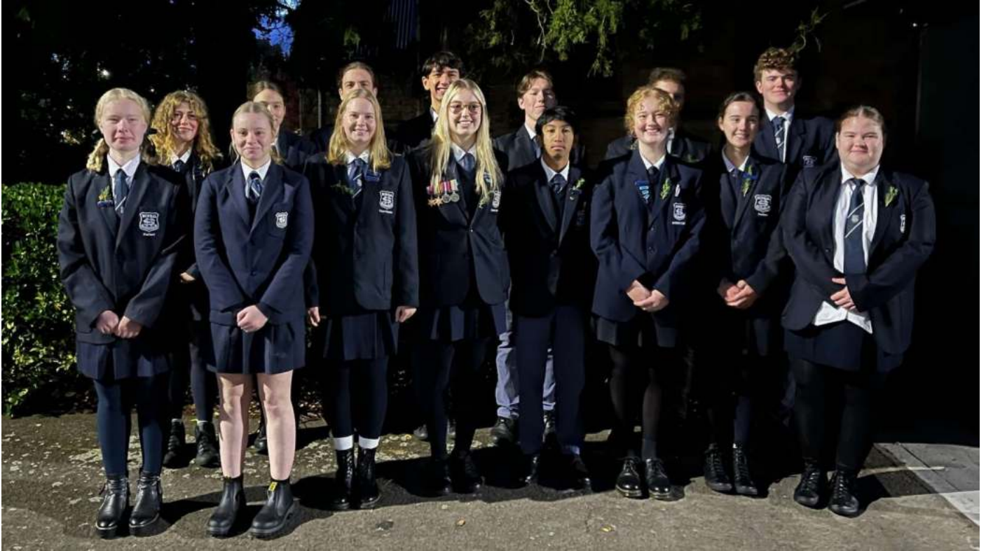
The Dawn service Mittagong.