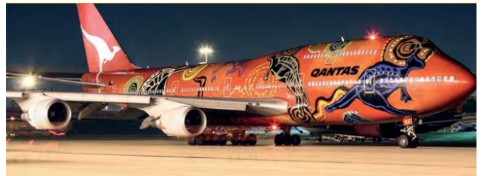
The 747 delivered in its Wulnala Dreaming livery

Sharelle started the journey with a photo of the first Qantas 747 delivered in the distinctly Australian livery of “Wulnala Dreaming”, - red, blue, and green colours depicting Desert, Mountains and Kakadu respectively. Considered the most beautiful plane and dubbed “Queen of the Skies”, the plane was in Qantas service for 37 years.