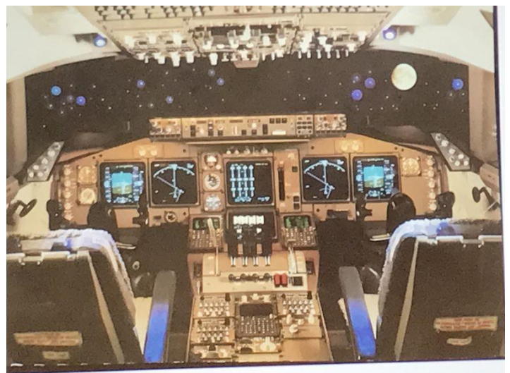
Cockpit of the Flight – Sharelle sat on Left seat and 1 st Captain on Right Seat