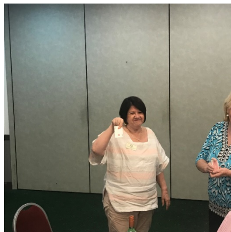
The face of disappointment