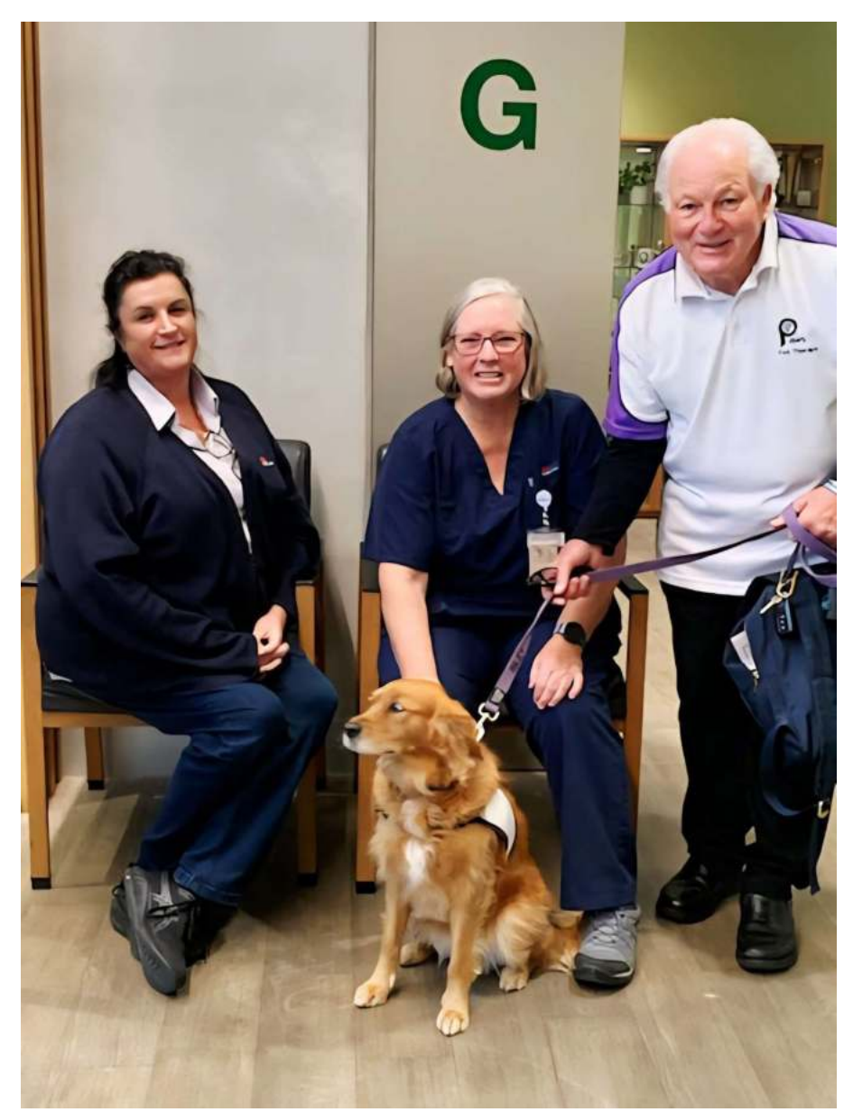
RILEY THE COMPANION DOG